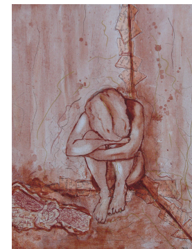
"Escape" by Kandy Stevens