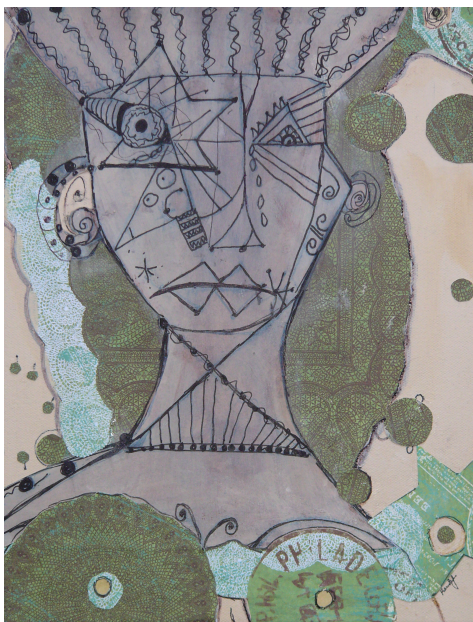
"The Other Mother" by Kandy Stevens